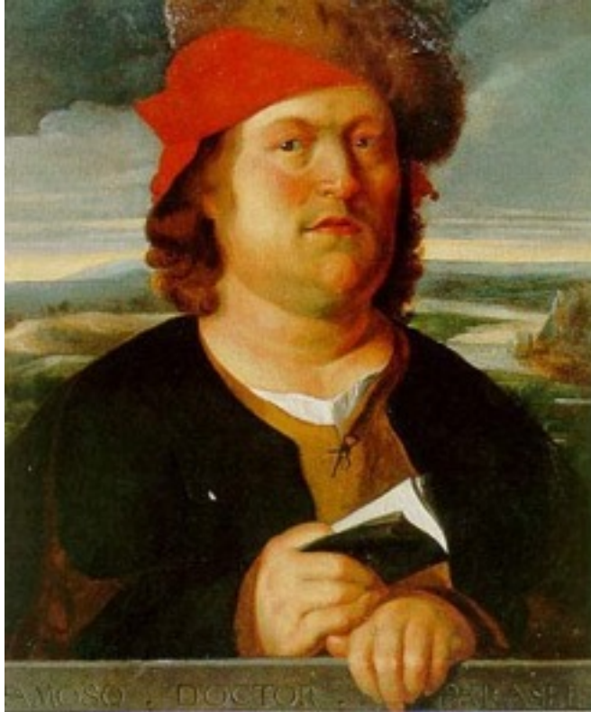
Paracelsus (1493-1591) German -Swiss philosopher, scientist

“What is there that is not poison? All things are poison and nothing without poison. Solely the dose determines that a thing is not a poison”.